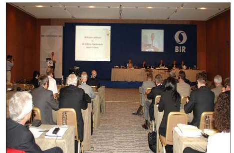
One of many workshops in session.