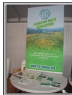
Pictured clockwise from top - RecycleNet Exhibit; Workshop attendees; Christina Treglia, TRC President welcomes the attendees; TRC Exhibit.