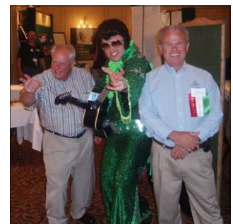
Elvis makes an appearance