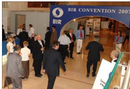
The BIR exhibit hall opens.