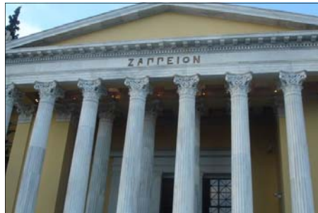
The Zappeion Mansion held the opening reception.

BIR will hold their mid-year meetings in Warsaw, Poland in October.