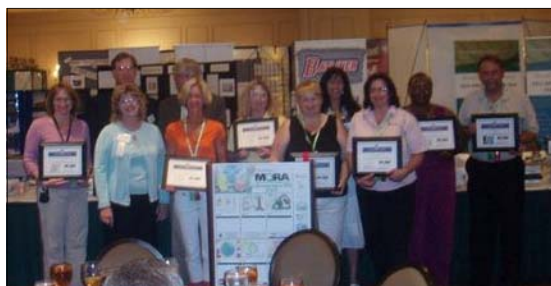
MORA Award Recipients