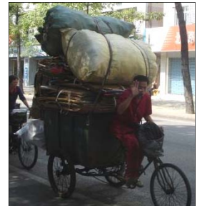
Cardboard & plastics collection on the streets of Guangzhou.